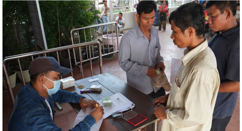
Cambodian workers crossing the border into Thailand

As part of these new policies, passport costs for Cambodian workers and students were reduced, and efforts were made to increase the speed at which government offices can issue registration documents, such as birth certificates and family record books, to help returning migrants secure documents before leaving the country once more. Cambodia's Labour Migration Policy for 2015-2018 was signed and aimed to establish legal frameworks and mechanisms in line with international standards, enhance the role of ASEAN in ensuring access to