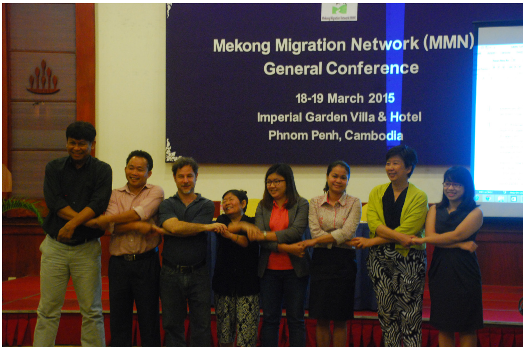
Old and new members of the Steering Committee at a photo-taking session at the 2015 MMN General Conference

Launched in 2003, the Mekong Migration Network (MMN) is passionate and dedicated about protecting and promoting the rights of migrant workers and their families. Migrants in the region face many difficulties: human trafficking, labour exploitation, extrajudicial killing, and injustice.