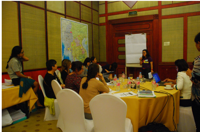
The first consultation meeting for the Roles of Countries of Origin project

While destination countries should rightly bear much of the responsibility for the protection of migrant workers inside their territory, countries of origin must also play a proactive role in ensuring that their nationals migrating abroad are protected. With this principle in mind, and with countries of origin in the GMS, such as Myanmar and Cambodia, currently rapidly revising their migration policies, MMN launched a new project in April 2015 that focuses on examining the roles of countries of origin.