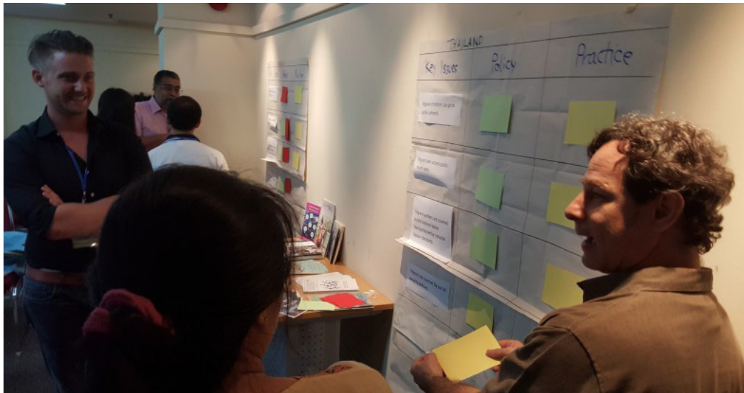
Interactive activities at the MMN workshop at the APF

Seeing it as a strategic venue for exchanging ideas with other CSOs and forging solidarity, MMN has participated in the ASEAN Civil Society Conference (ACSC)/ASEAN People's Forum (APF) since 2005. In April 2015, five representatives of MMN participated in the ACSC/APF and organised two workshops, one focusing on issues of social exclusion of migrants in ASEAN and the other focusing on living wages.