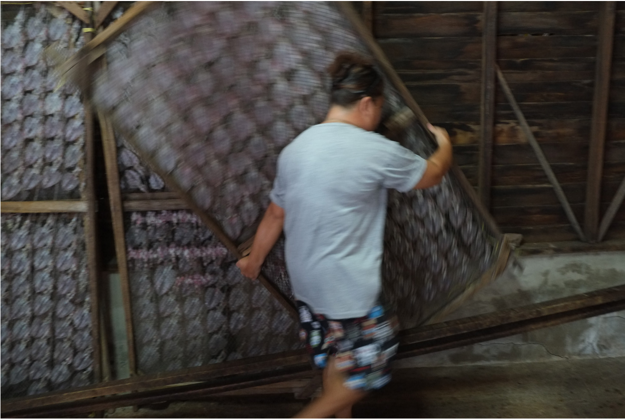
Cambodian worker at a seafood processing operation in Rayong, Thailand

Although Malaysia and Indonesia have since agreed to take in and provide humanitarian assistance to thousands of migrants trapped at sea to alleviate the crisis, Thailand has thus far been unwilling to accept any migrants into the country. 23