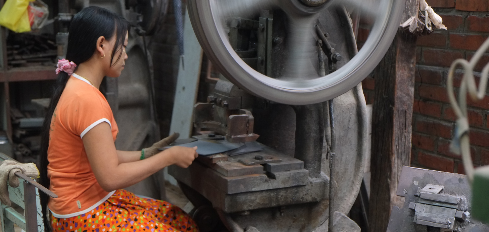
A worker at a furniture factory in Myanmar

Despite positive political reforms in the capital, conflicts in ethnic states continued this year. Rohingya people continued to flee the country against a backdrop of violence, persecution, and harsh conditions in internally displaced persons (IDP) camps in Rakhine State. The Myanmar government signed a ceasefire agreement with eight different armed groups this year but has yet to reach effective peace agreements with the seven other major groups, including those in Kachin and Shan State, where fighting continues to erupt.