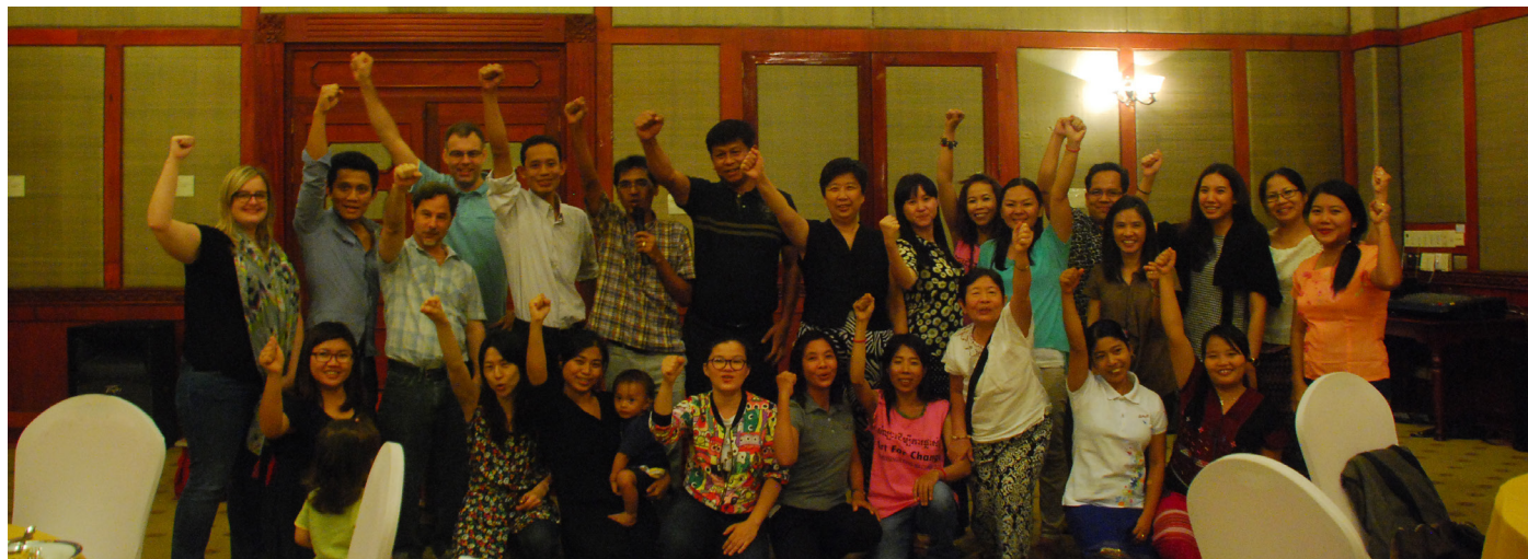
MMN members at the MMN Sixth General Conference

Throughout 2015, MMN continued its work promoting and protecting the rights of migrants in the region through joint advocacy, information monitoring, research, capacity building, and networking. MMN continued to strengthen its organisational capacity, reach out to new members, and expand its operational bases. In particular, MMN forged partnerships with Myanmar civil society organisations, something that was previously very difficult to do due to the sensitivity of migration issues under the military government. Two organisations, namely 88 Generation Peace and Open Society (Labour Department) and Labour Rights Defenders and Promoters, have formally joined MMN as members, while many other organisations have also regularly collaborated with MMN on various projects.