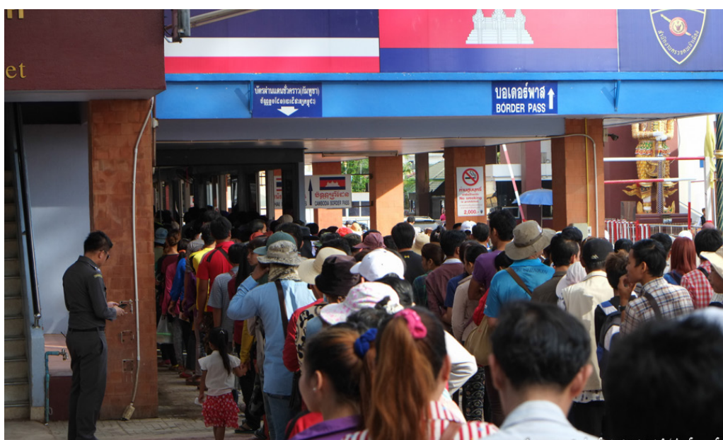
Border immigration clearances between Thailand and Cambodia.

Since its rise to power during the coup of May 2014, the Thai military government, otherwise known as the National Council for Peace and Order (NCPO), has established a new process of registering undocumented migrants. One-Stop Service (OSS) centres were set up around the country for migrants to obtain a temporary residential permit and work permit (also known as a ‘pink card’) as interim documents as well as to renew temporary passports of migrants that expired in 2015. Migrants who obtained the pink card were still required to complete the NV process in order to stay and work in Thailand, however, those who failed to secure a pink card by the deadline could not complete the NV process. Inefficient coordination among the respective governments meant that most migrants could not complete the NV process within the year and faced uncertainty when renewing their pink cards.