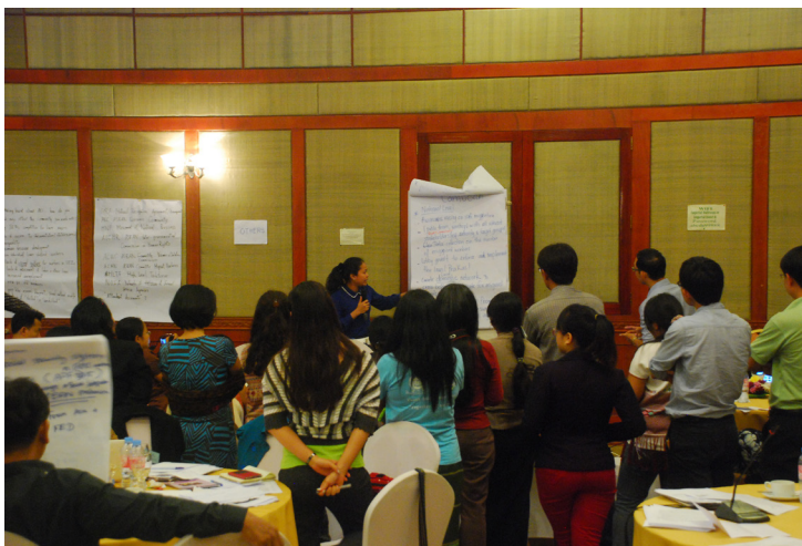
MMN members presenting on the results of their discussion

The workshop also provided an opportunity for participants to examine and discuss potential opportunities for civil society engagement with ASEAN, brainstorm future advocacy opportunities for ASEAN bodies including AICHR, ACWC, and AFML and improve knowledge and understanding on integration and mechanisms of ASEAN. Key outcomes included ideas for joint advocacy strategies and future capacity building and training to build on participants' knowledge gained from this workshop.