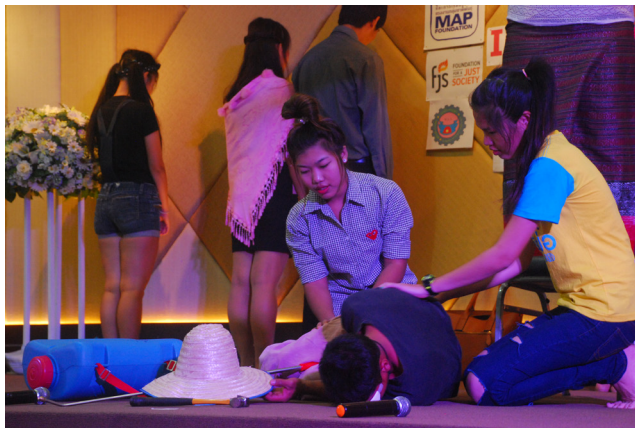
Migrant workers performances at the International Migrants Day event.

The MMN Secretariat, MMN member organisations, and other migrant rights groups, including Workers Solidarity Association (WSA), MAP Foundation, Shan Youth Power (SYP), Shan Women's Action Network (SWAN), Migrant Workers Federation (MWF), Human Rights and Development Foundation (HRDF), and EMPOWER Foundation, organised the 25th IMD celebration in Chiang Mai. The day's theme of "Living Wages" highlighted the gap between the cost of living and the wages of migrant workers. Around 140 participants attended the celebration, including migrant workers, CSOs, academics, and government representatives.