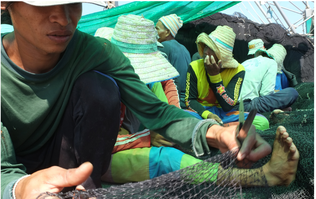
Migrant workers repairing fishing nets in Rayong, Thailand

The largely informal nature of migration flows in the region has led many of the governments in the region to become focused on issues of national security, the prevention of undocumented migration, the elimination of trafficking, and the regularisation of migrants' immigration statuses.