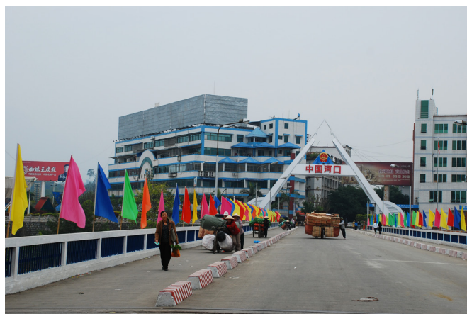
The border of China and Vietnam

Due to the higher proportion of men compared to women in China, the demand for Vietnamese 29 and Burmese 30 women remained high, making the bride trade between China and these countries prevalent. By 2020, there will be an estimated 30 million more Chinese men than women of marrying age. 31