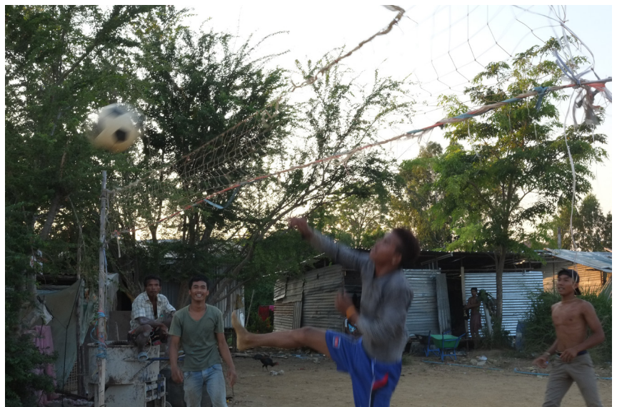
Cambodian migrant workers relaxing after work Rayong, Thailand