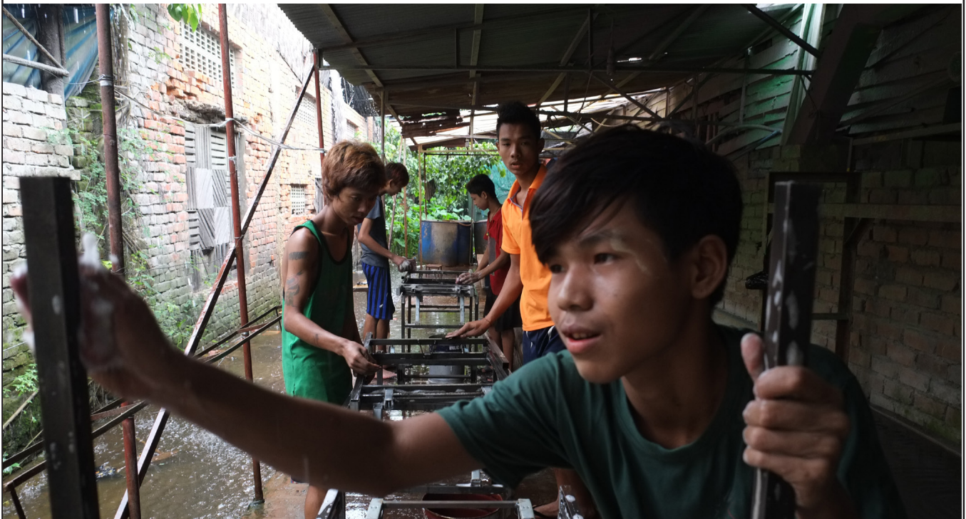
A group of workers putting together a table in Myanmar