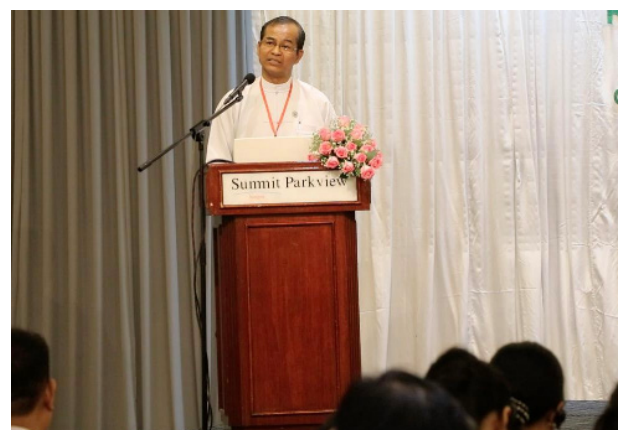
Director General U Win Shein, Department of Labour, Myanmar