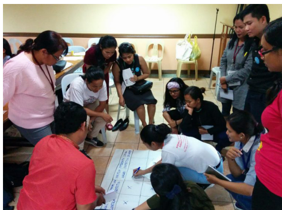
Interactive Activities at the MMN workshop

The ASEAN Civil Society Conference/ASEAN Peoples' Forum (ACSC/APF) 2017 took place at the University of the Philippines, Diliman, Quezon City, Philippines from 10-14 November and adopted the theme of "Beyond Boundaries: Strengthening Peoples' Solidarities for a Just, Equitable, and Humane Southeast Asia." Although this year marks the 50th Anniversary of ASEAN, civil society across the region continues to be excluded from ASEAN's development and high-level decision-making processes.