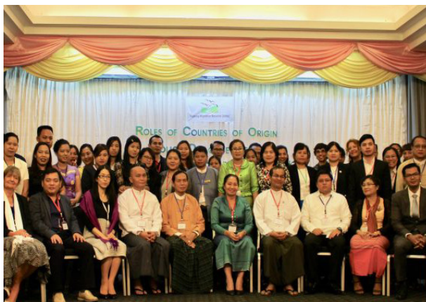
Group Picture at the Policy Dialogue