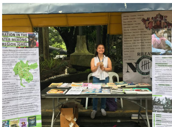
MMN Publication Booth at the ACSC/APF