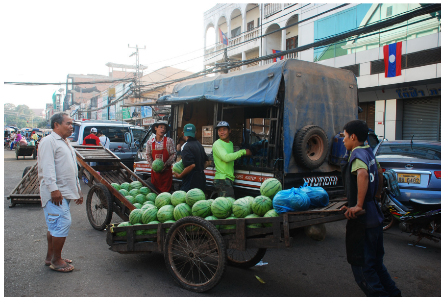
Fruit vendors in a border town in Loa

Under the MOU on Labour Cooperation between Laos and Thailand in 2016, the fourth Post-Arrival and Reintegration Centre for Migrant Workers was opened in April in Mukdahan, Thailand, with the participation of both Lao and Thai government representatives. This centre served to assist both potential Laos migrant workers who wished to work in Thailand and returnees from Thailand. 38