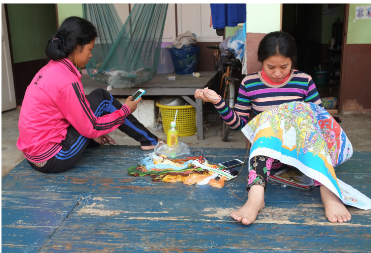
Cambodian women managing domestic chores after work at a migrant community in Rayong, Thailand

As for the NV process, the Thai government has extended the deadline for migrants to complete the process and obtain the necessary legal documents to June 2018. 50 According to the Ministry of Labour, as of December 2017, 1,248,611 migrant workers entered into Thailand irregularly but later completed the NV process, 550,188 migrant workers migrated through MOUs, and 19,909 migrant workers registered as seasonal workers under section 14 of Working of Alien Act B.E. 2551. 51