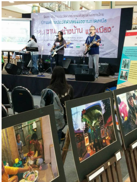
Music Performances at the exhibition worker, employer, and the media.