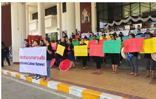
Congregation at the Chiang Mai City Hall to submit recommendations to the Vice Governor

From 30 April to 1 May 2017, MMN co-organised a 2-day event in honour of International Labour Day (also known as 'May Day') at UNISERV, Chiang Mai University, Thailand, in collaboration with the Northern Labour Network. Over 200 participants attended the event including migrant workers employed in various industries, representatives of CSOs, academics, Thai government officials, and members of the Northern Labour Network. Sunday 30 April, the first day of the event, commenced