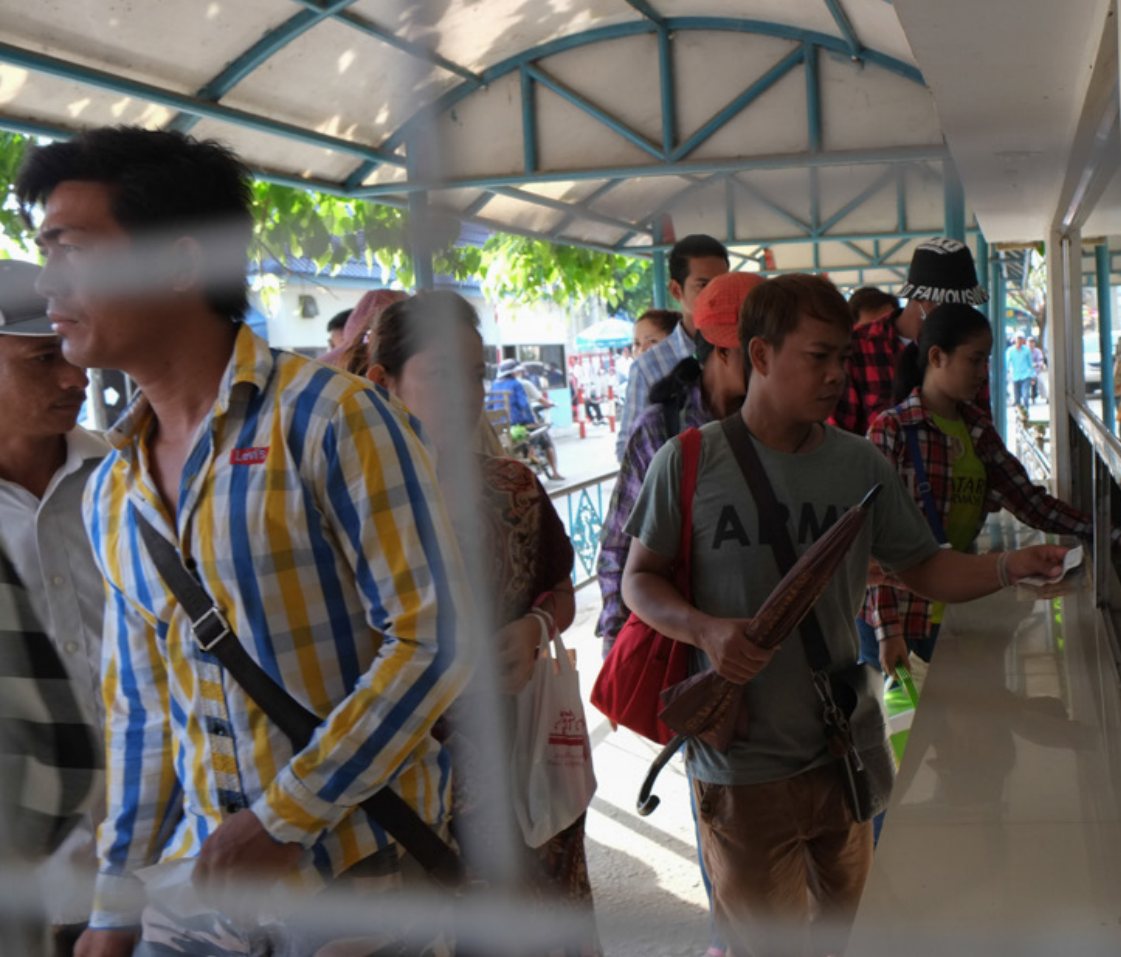
People crossing the border from Cambodia to Thailand

cross-border trade in early November, which came into effect on 13 November 2017. Both countries agreed to increase efforts to boost cross-border trade, with the goal of reaching $15 billion by 2020. This bilateral agreement can potentially increase the movement of workers between the two countries. 19